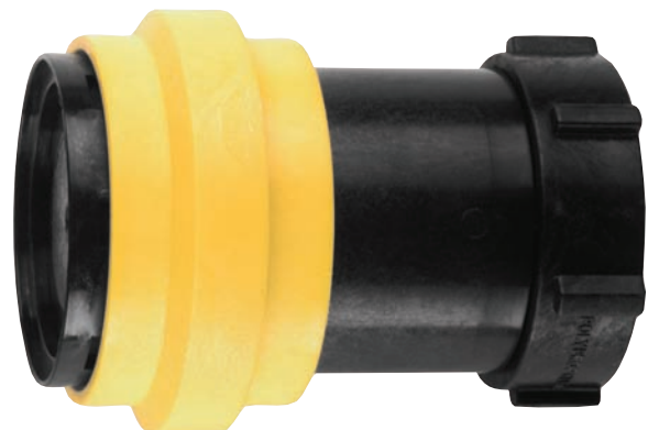
Male & Female Sold Separately